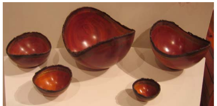
“Fenix-1” by Francisco Clemente.