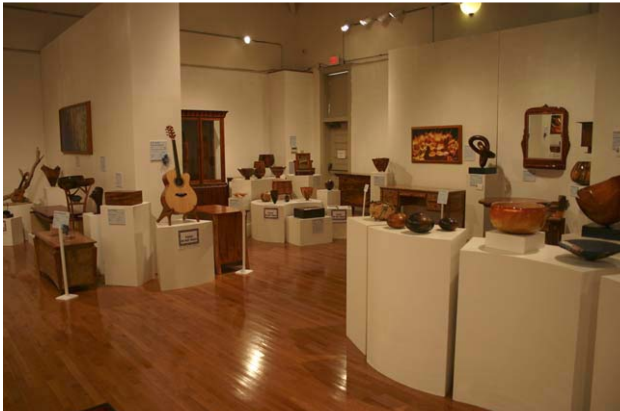
Hawaii's Woodshow 2007 pieces on display at the Honolulu Academy of Arts